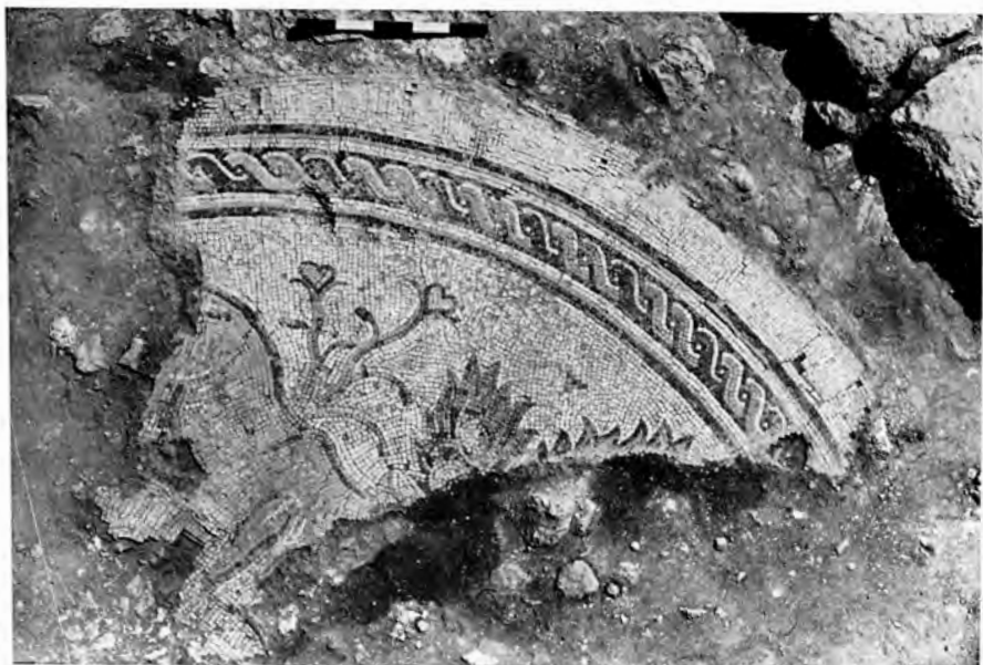
A. Area A: the apsidal mosaic fragment (A. 3:3) from the 6th-century church