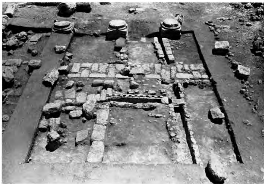
A. Area A: Square 2, looking toward the south, showing the Arab water channels running from north to south (cutting through Wall A. 2:8) and from east to west