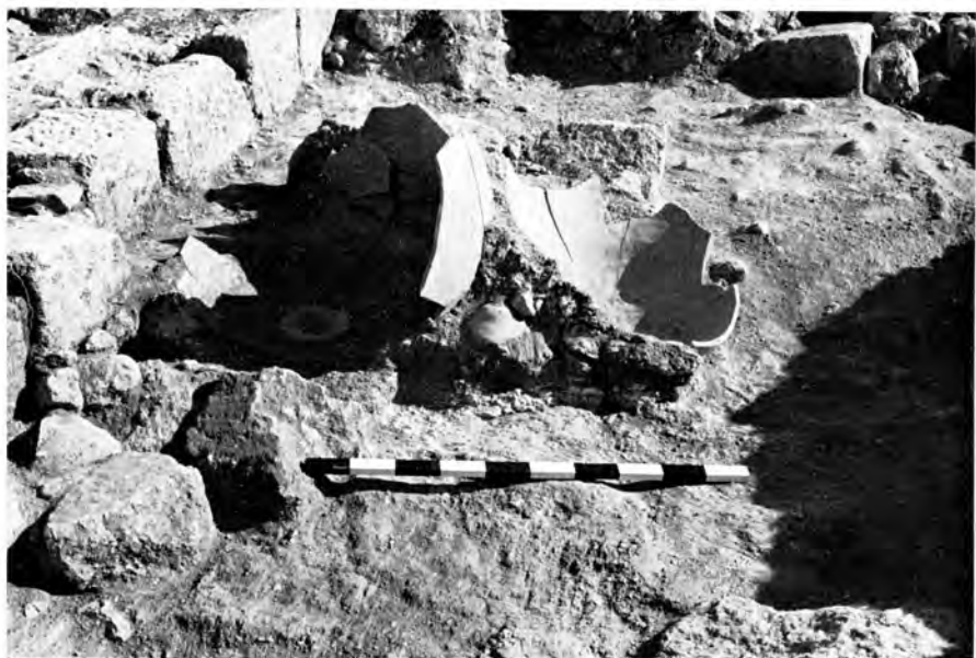
B. Area A: storage area in Square 1 with remains of huge storage jars excavated