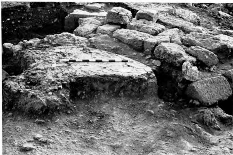
B. Area A: cement bed of the apse mosaic after its removal. Filler Wall A. 3:4 is visible behind it