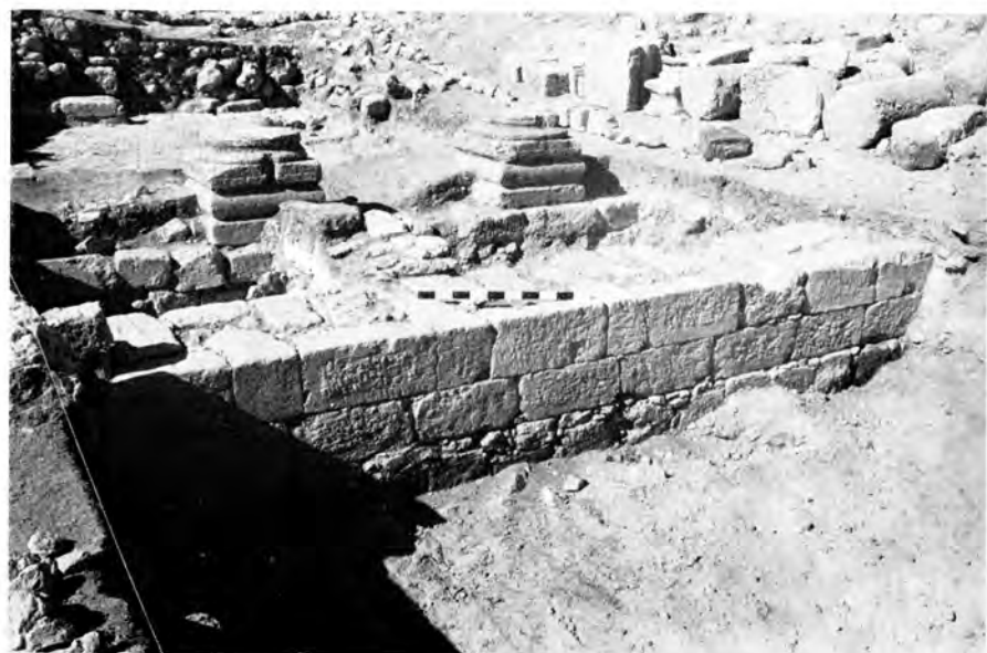
B. Area A: north face of north wall of the church (A. 2:8) in Square 2. The two column bases behind it stand on the balk between Squares 2 and 4