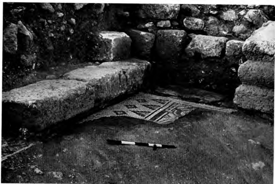
B. Area A: mosaic floor fragment (A. 4:8) shown as found in relationship to architectural features surrounding it