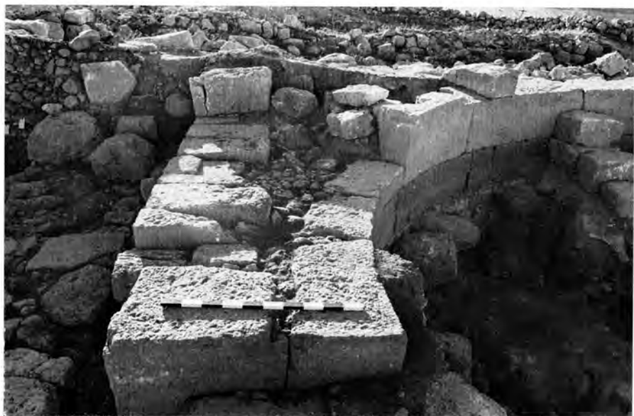
A. Area A: the end of the northern leg of the apse wall (after removal of the balk between Squares 1 and 3) and junction with Wall A. 1:9. The left stone on which the meter stick rests is reused and bears a Corinthian capital leaf pattern carved on its north face and its bottom face