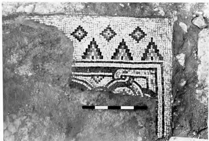
Area A: the fragment of a mosaic floor (A. 4:8) from the central aisle of the church