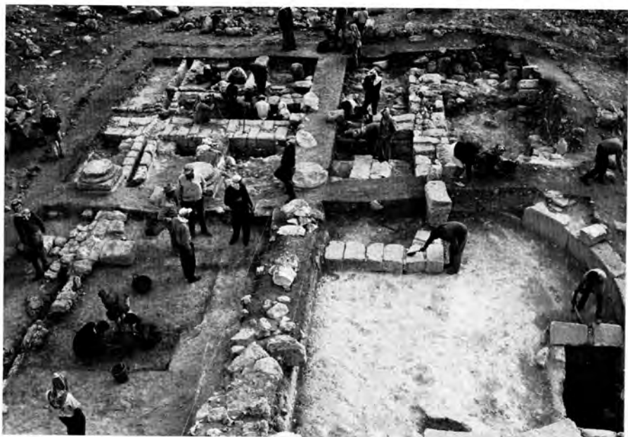
A. Area A: looking north over all four Squares. In the right foreground is the apse of the church with its intrusive Arab cistern (A. 3:8). In the center, running from left to right, are three column bases of the church, and behind them the church's north wall (A. 2:8)