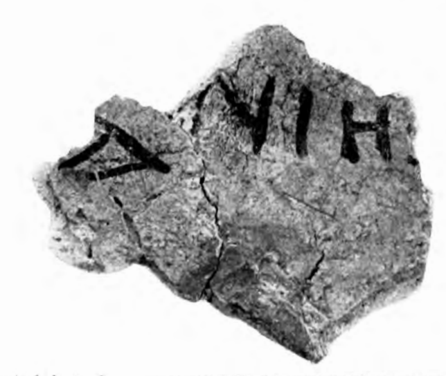
A. Fragment of plaster from the church with the word [\Delta]ANIH[\Lambda] painted on it (Actual size)