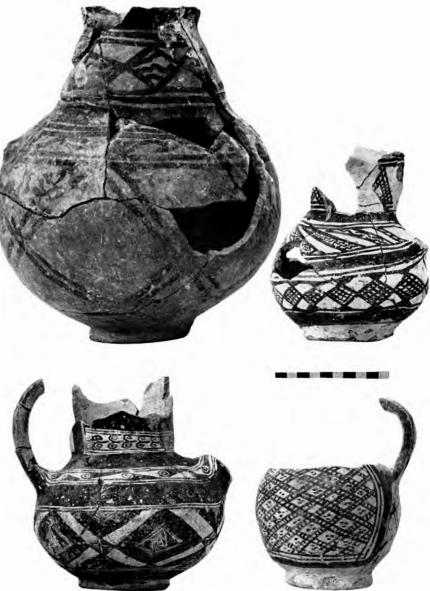
Painted Arab vessels from the cistern of Area C