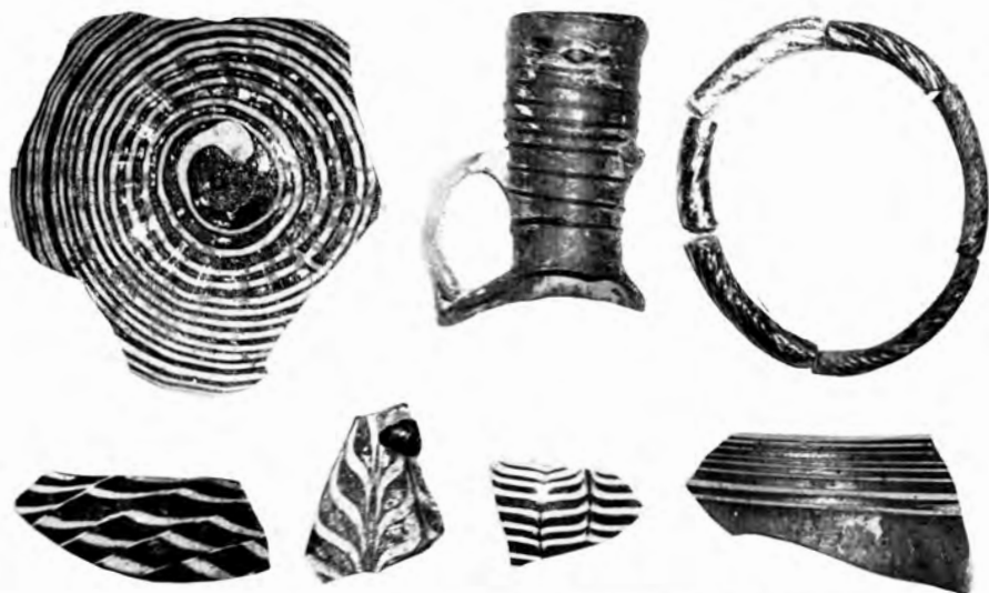
B. A variety of fragments from colored glass vessels and of glass bracelets