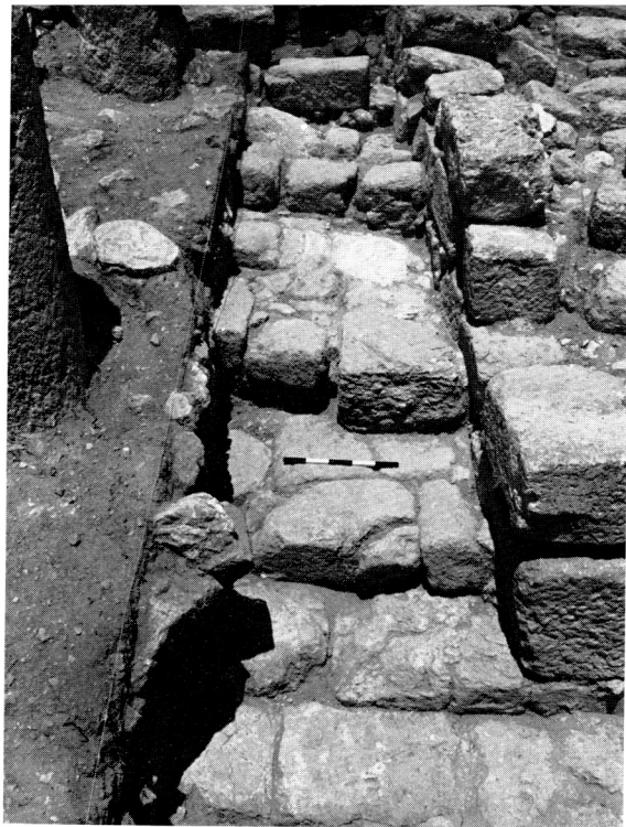
B. Area D: the stairway in Square 2 with Wall D. 2:2 on the right